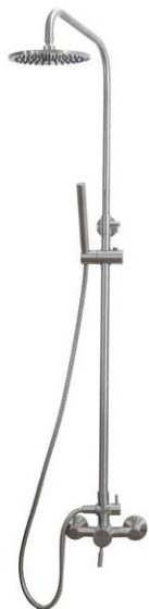
720405 Premium Shower Hardware