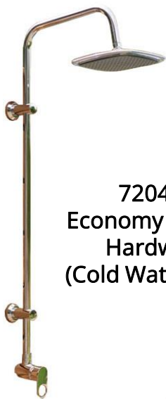
720404 Economy Shower Hardware (Cold Water Only)