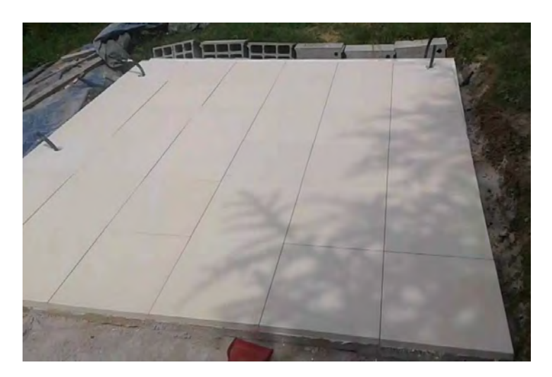
Patio Stone/Paver Blocks