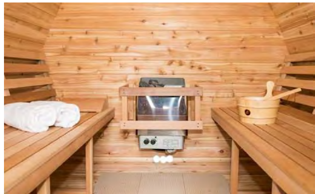
Inlet under electric heater on Back wall

For Saunas with wood heaters, get the inlet as close as possible to the wood heater and the outlet high in the opposite corner.