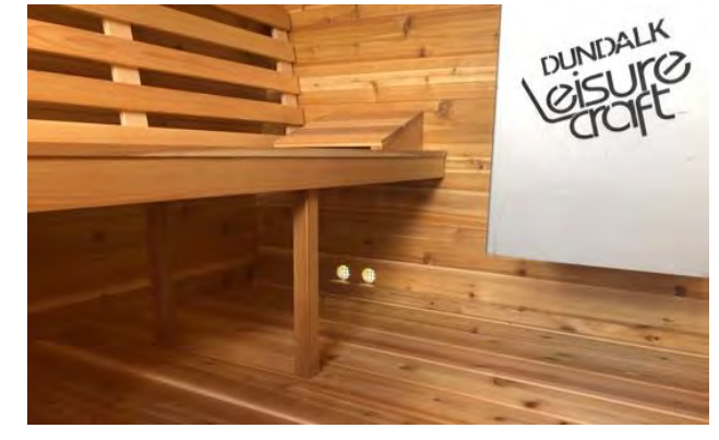
Inlet beside wood heater on Back wall