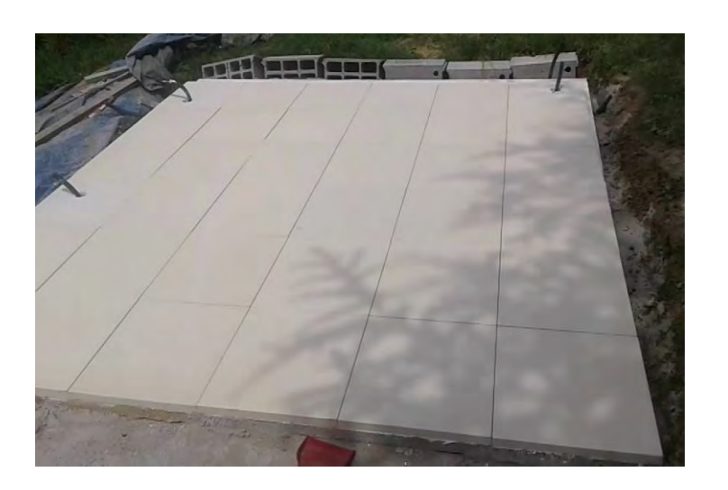
Patio Stone/Paver Blocks

It is recommended to build a base larger than required to provide a sitting area for cooling off during your sauna session.