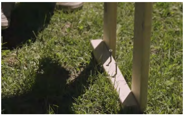
Place 2- 2 ½" (64mm) screws into the pre-drilled holes on either side of heater guard to prepare for mounting.

Repeat for the bottom heater guard support.