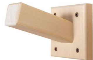
603022 Single Towel Hook (White Cedar)