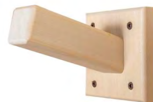
603022 Single Towel Hook (White Cedar)