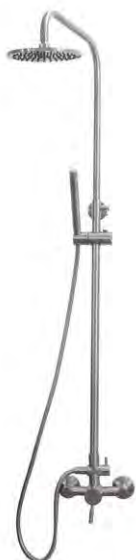
720405 Premium Shower Hardware