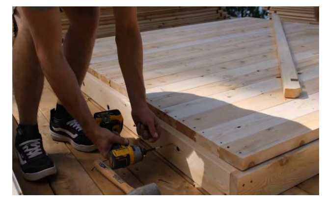
Place 3 -3" (76mm) screws into each of the side supports.

If not, measure how much it is past the inside edge and cut the floor stave accordingly.