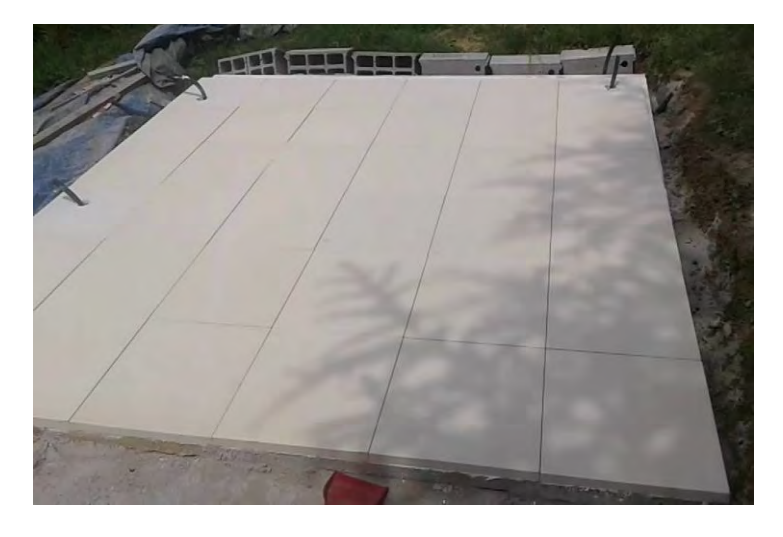
Patio Stone/Paver Blocks

It is recommended to build a base larger than required to provide a sitting area for cooling off during your sauna session.