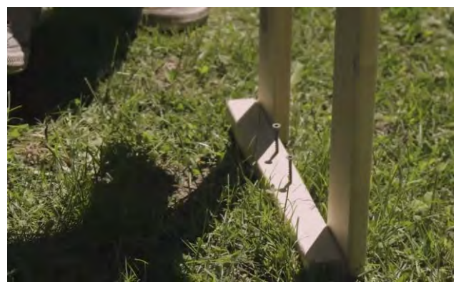
Place 2- 2 ½" (64mm) screws into the pre-drilled holes on either side of heater guard to prepare for mounting.

Repeat for the bottom heater guard support.