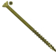
#10 x 5" Wood Screw X 150