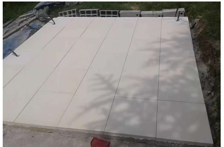
Patio Stone/Paver Blocks

It is recommended to build a base larger than required to provide a sitting area for cooling off during your sauna session.