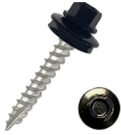
Roofing Screw X 250