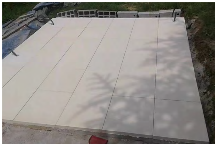
Patio Stone/Paver Blocks