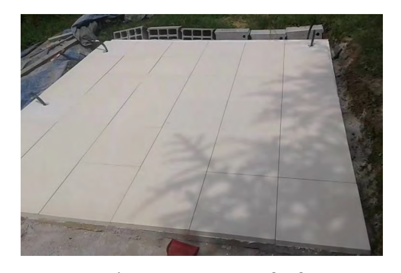
Patio Stone/Paver Blocks

It is recommended to build a base larger than required to provide a sitting area for cooling off during your sauna session. Manufactured by: