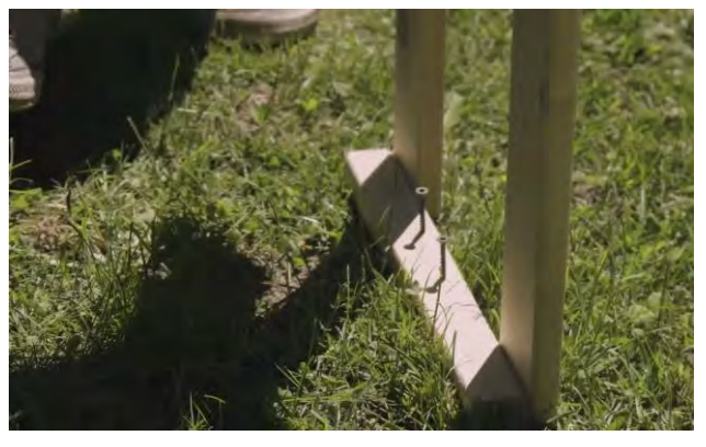
Place 2- 2 ½" (64mm) screws into the pre-drilled holes on either side of heater guard to prepare for mounting.

Repeat for the bottom heater guard support.